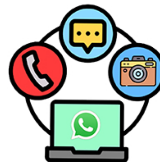
Updates on PUB changes