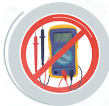
No testing or inspection