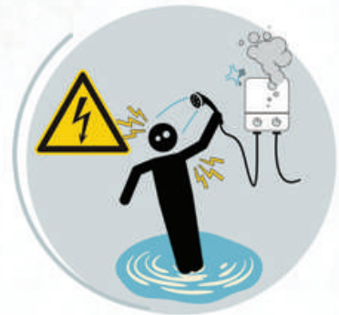
Electrocution Risk while showering