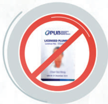
No Licensed Plumber Supervision