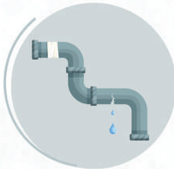
Using unapproved materials